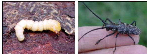
Immature and adult pine sawyer beetles

Pinewood nematodes are carried from tree to tree by pine sawyer beetles. Immature pine sawyer beetles tunnel in the wood of dying pines, such as those dying from pine wilt. When the beetles mature and emerge from the wood, they may carry thousands of nematodes on their bodies.