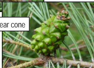
2nd year cone