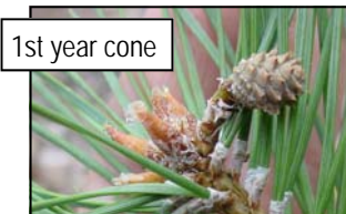
1st year cone